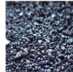
Direct Reduced Iron